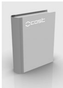
1982 | Action Number: Physico-chemical Behaviour of Atmospheric Pollutants - Activity Report 1981