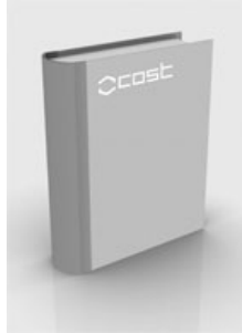
1982 | Action Number: Comportement Physico-chimique des Polluants Atmospheriques - Rapport d'activite 1978-1980