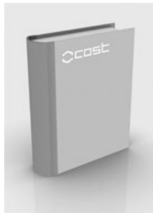
1982 | Action Number: Treatment and Use of Sewage Sludge - Activity Report 1980-1982