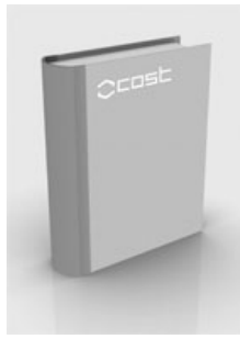
1982 COST Repertorium