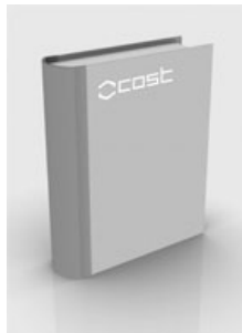
1982 | Action Number: Treatment and Use of Sewage Sludge - Activity Report 1980-1982